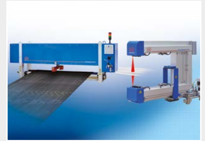
Measuring and inspection systems for metal strips, plastics and rubber